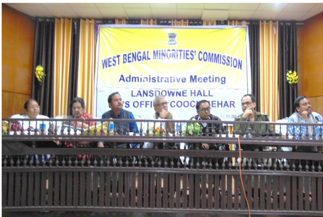
Figure 10: Administrative Meeting at Coochbehar on 29.11.2017