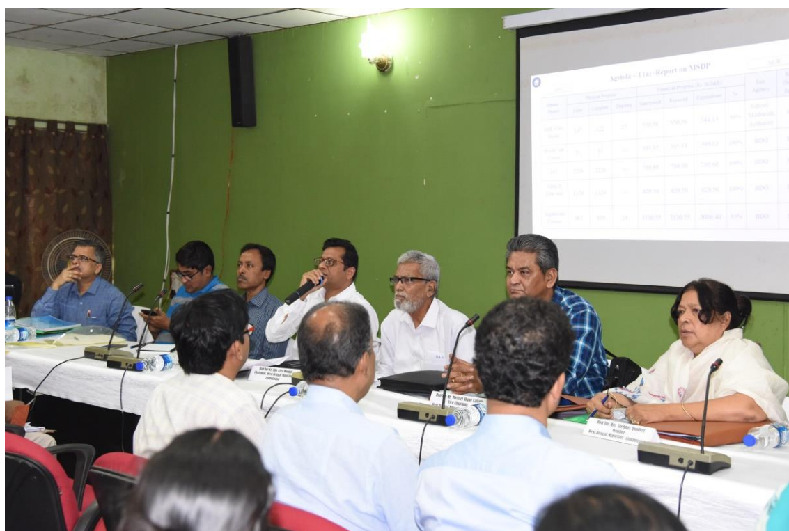
Figure 20: Administrative Meeting at Dakshin Dinajpur on 23.03.2018