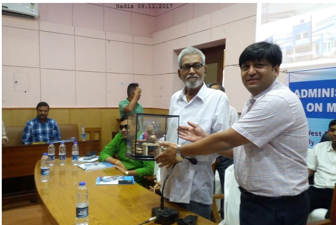
Figure 8: Administrative Meeting at Nadia on 09.11.2017