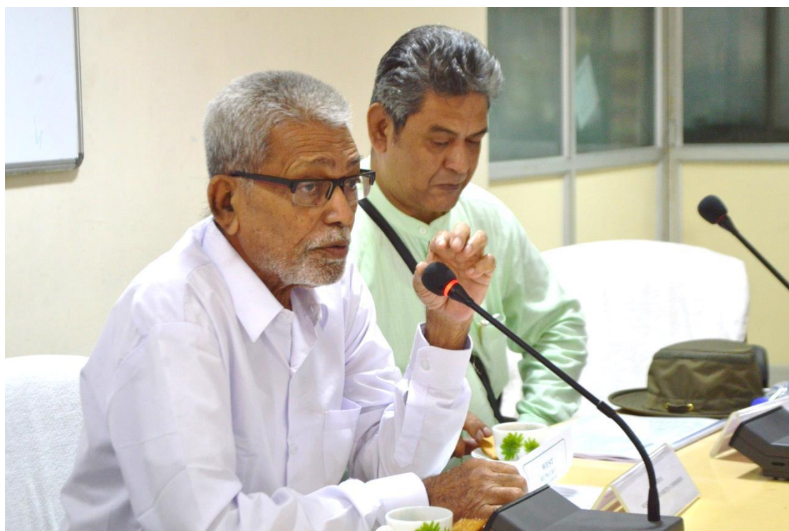
Figure 4: Administrative Meeting at Bankura on 11.09.17