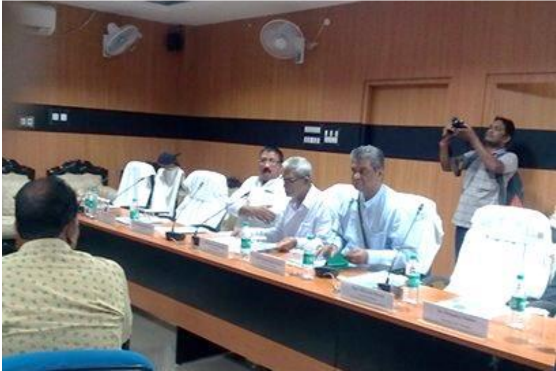
Figure 5: Administrative Meeting at Purulia on 12.09.17