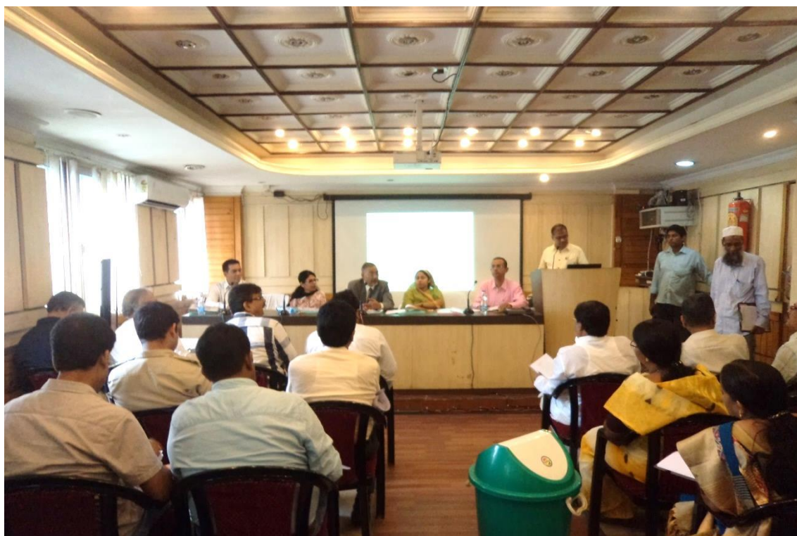
Figure 1: Administrative Meeting at South 24 Parganas on 20.06.2017