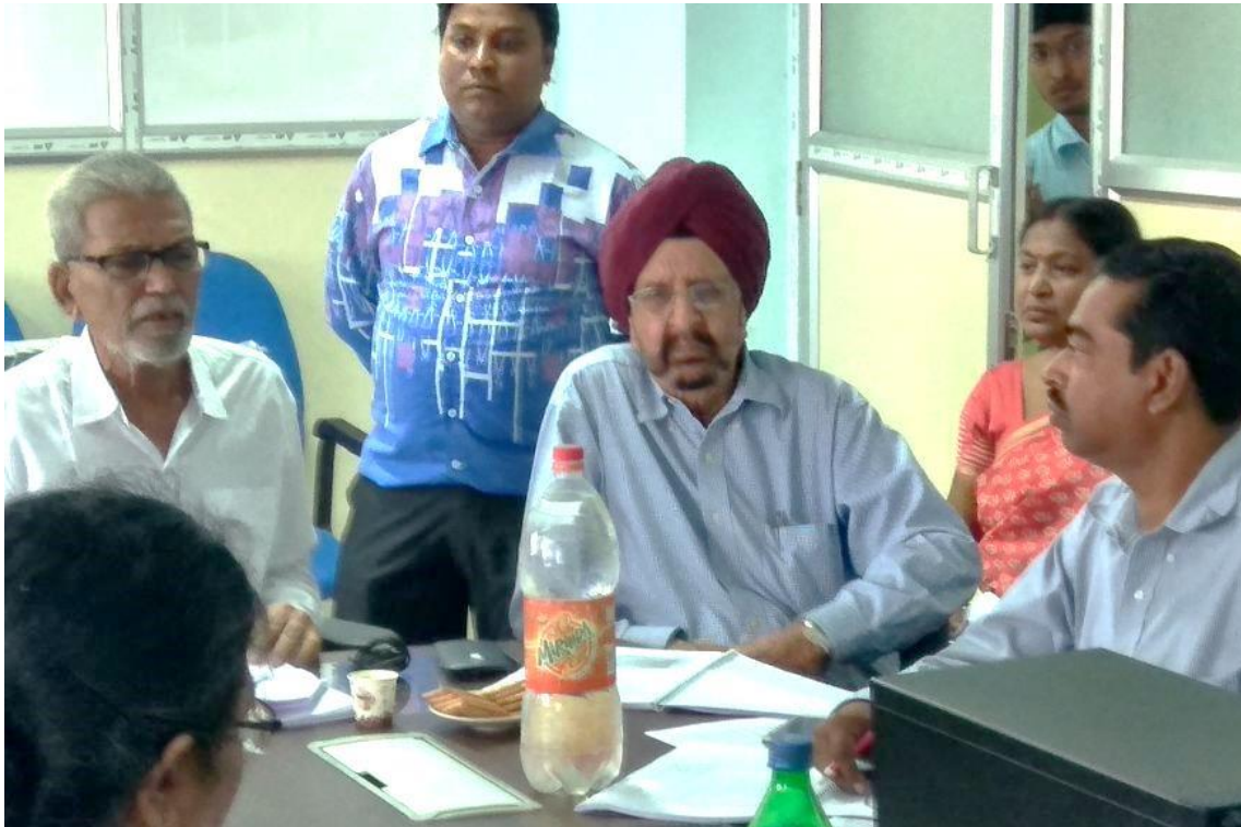
Figure 7: Administrative Meeting at Kolkata on 02.11.2017