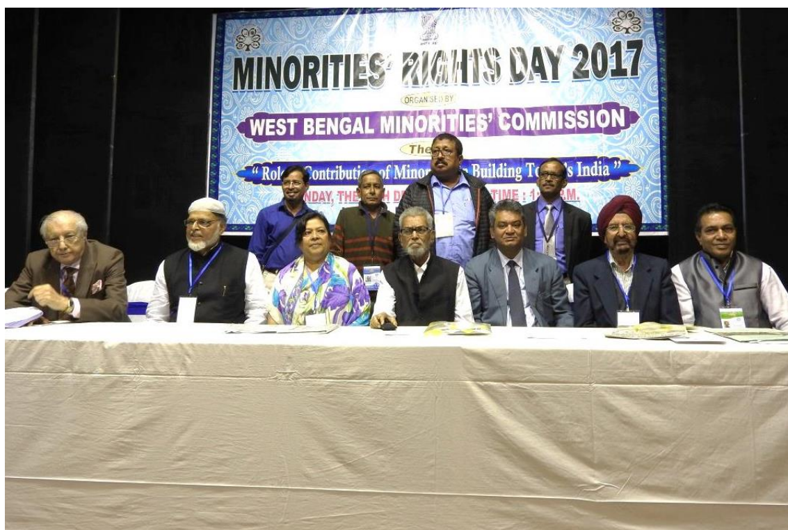
Figure 36: All the Hon'ble Members of the Commission