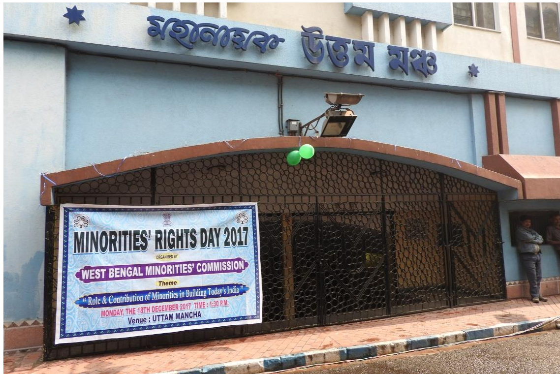
Figure 21: Uttam Mancha