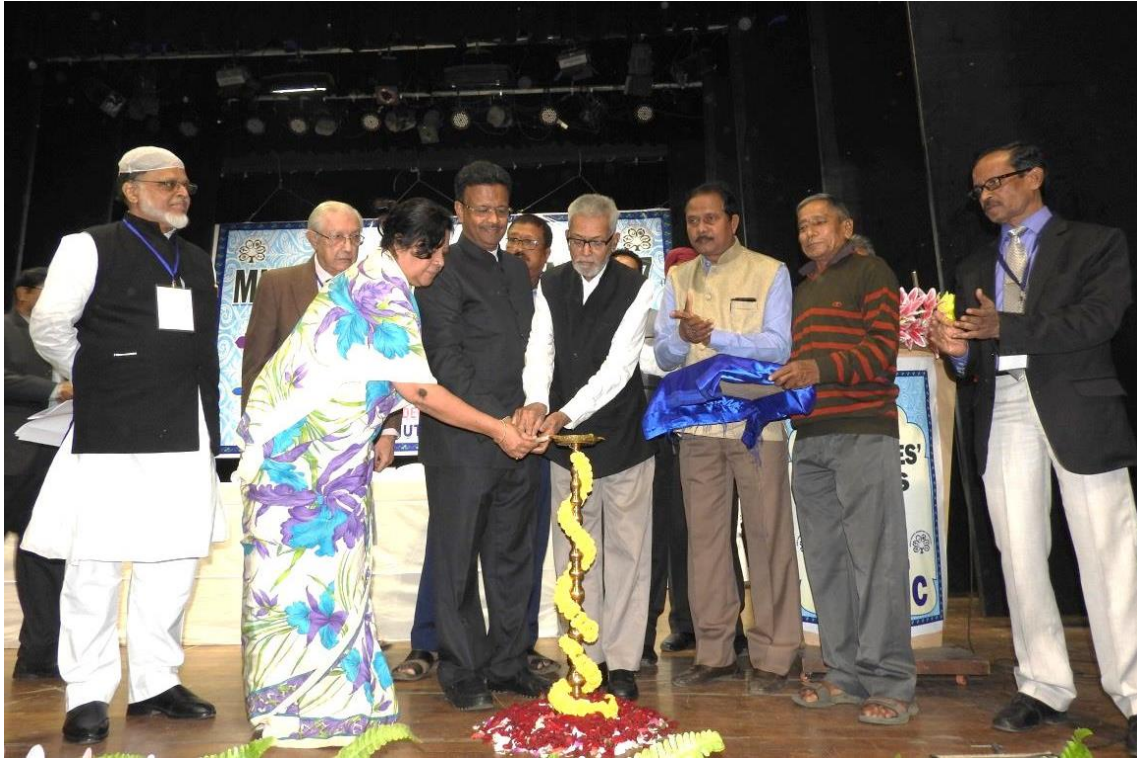
Figure 23: Auspicious Lamp is lit by Hon'ble Members of the Commission