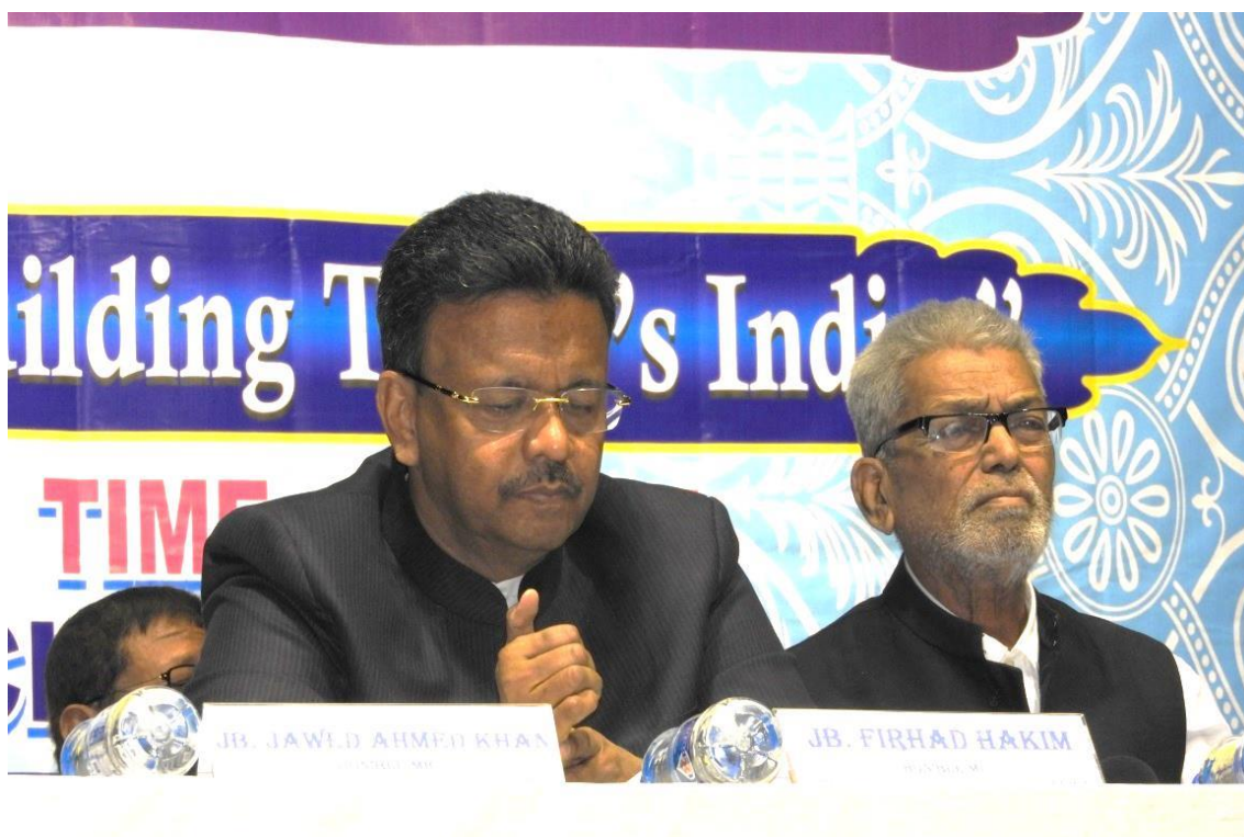
Figure 29: Hon'ble Chief Guest, Janab Firhad Hakim on the Dias