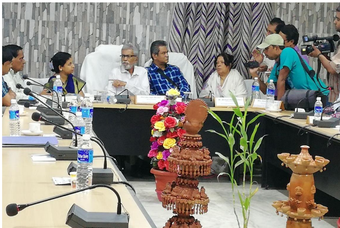
Figure 19: Administrative Meeting at Uttar Dinajpur on 23.03.2018