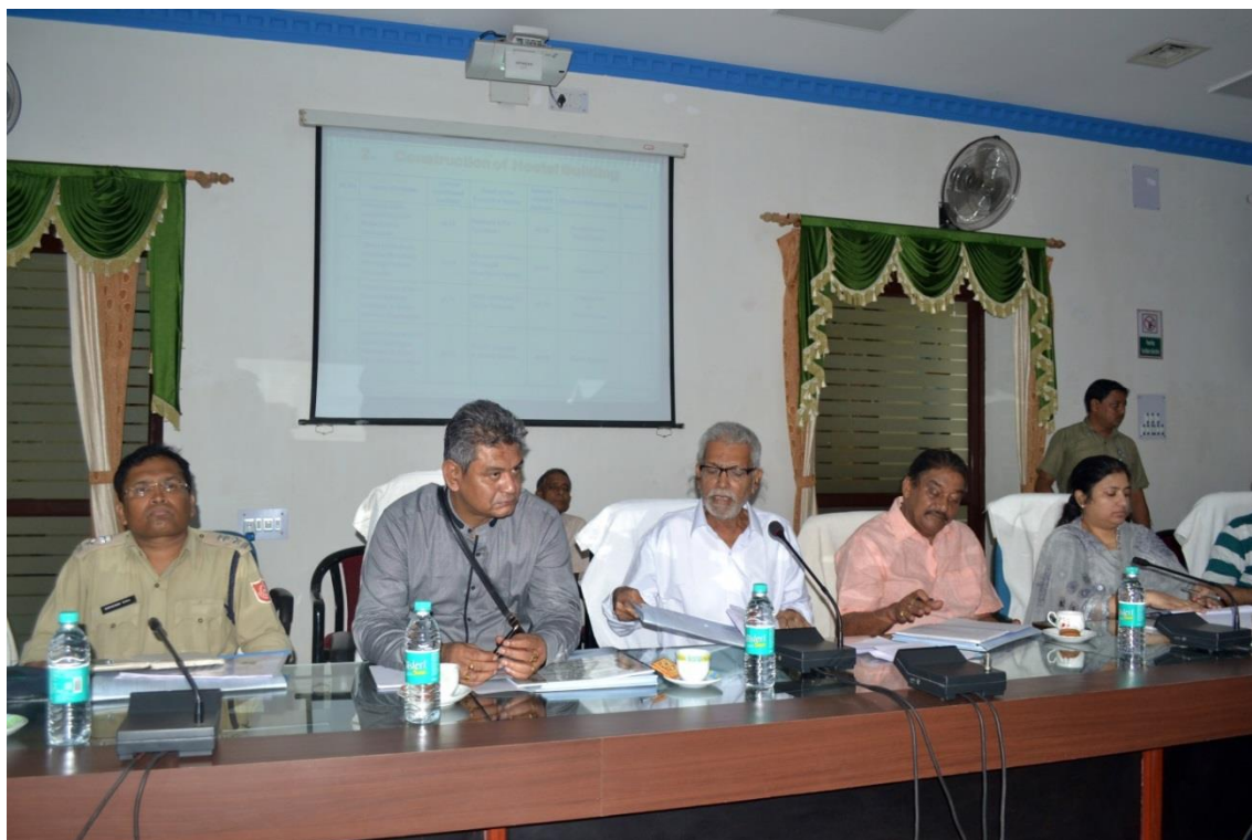
Figure 3: Hon'ble Chairman at Administrative Meeting at Purba Bardhaman on 29.08.2017