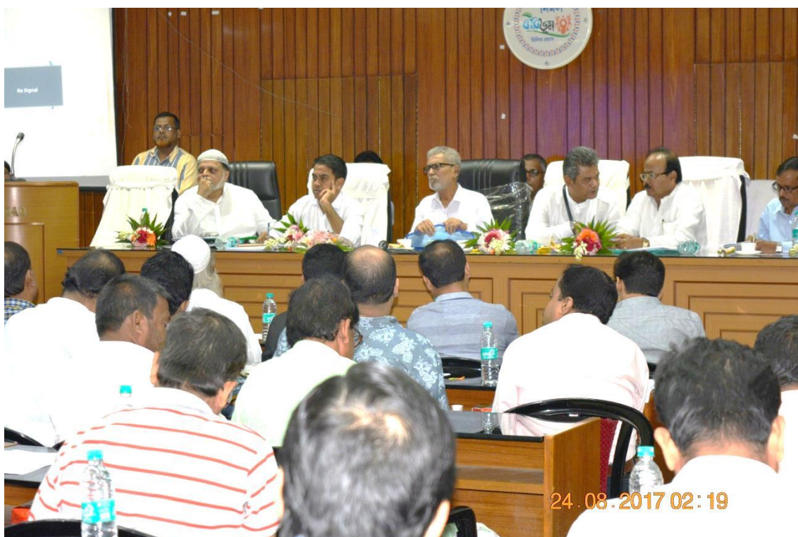
Figure 2: Administrative Meeting at Birbhum on 24.08.2017