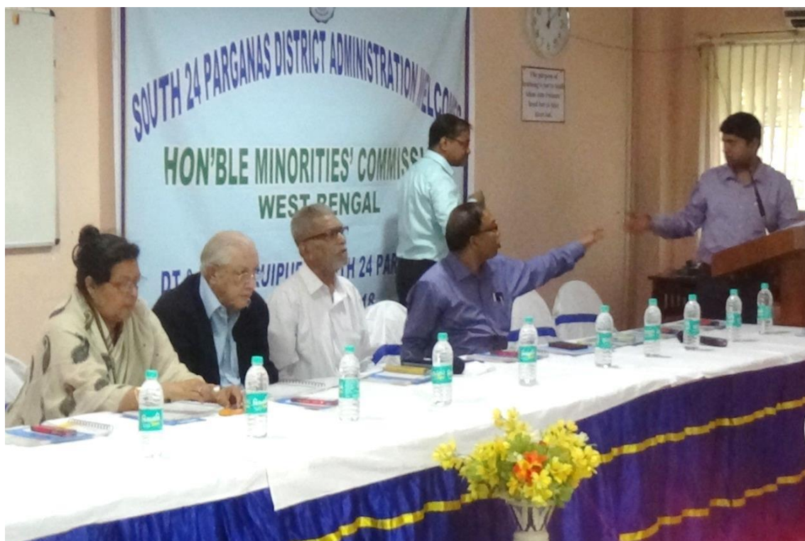
Figure 17: Administrative Meeting at South 24 Parganas on 27.02.2018