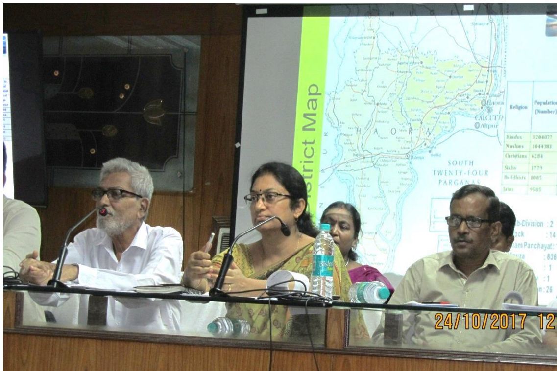
Figure 6: Administrative Meeting at Howrah on 24.10.2017