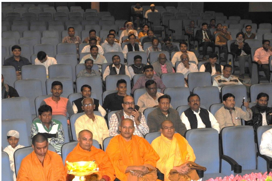
Figure 28: Audience at the Venue