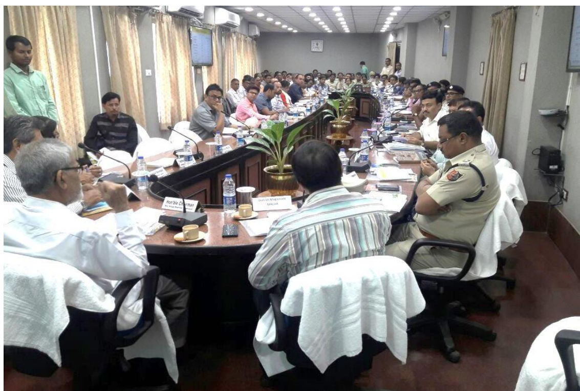
Figure 18: Administrative Meeting at Malda on 22.03.2018