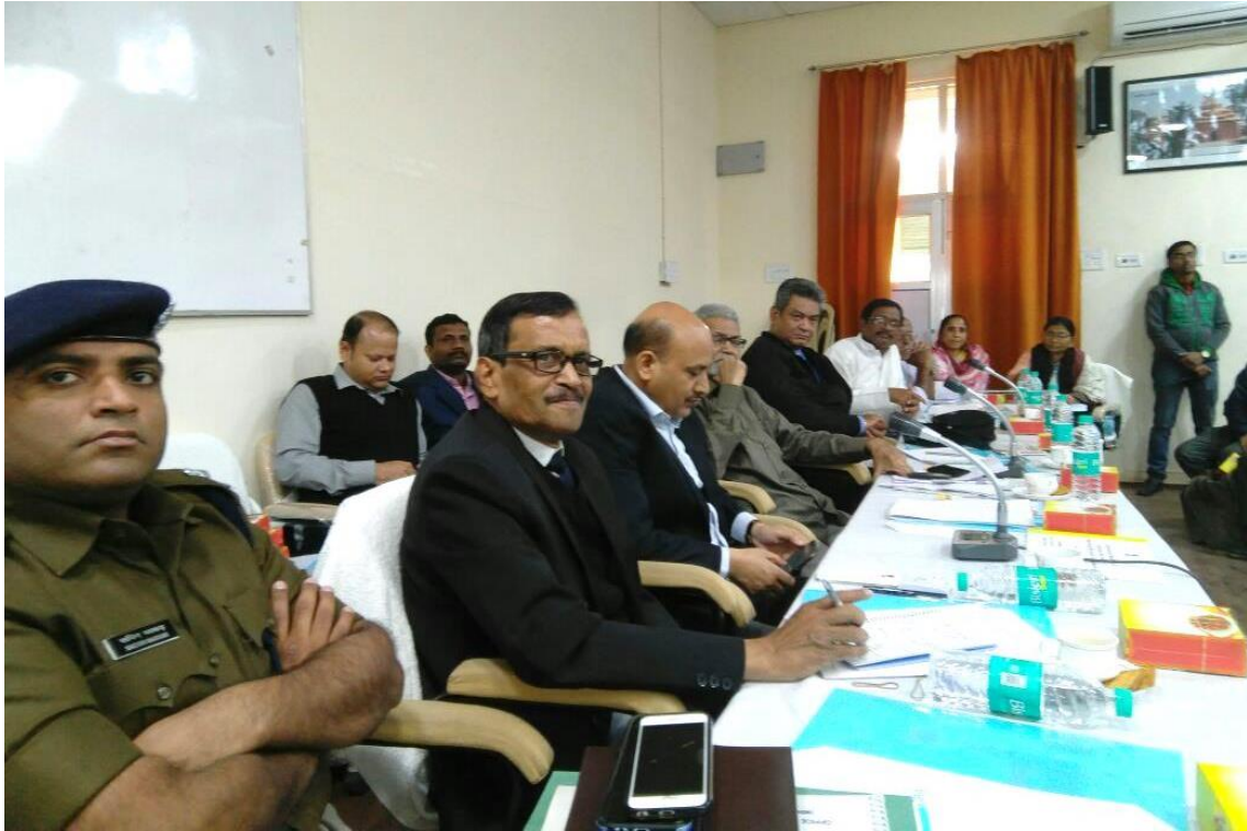
Figure 13: Administrative Meeting at Paschim Medinipur Administrative Meeting on 29.12.2017