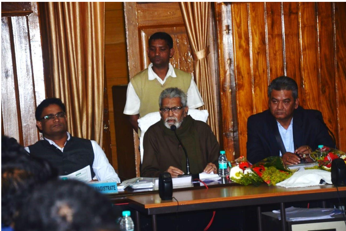
Figure 14: Administrative Meeting at Murshidabad on 25.01.2018