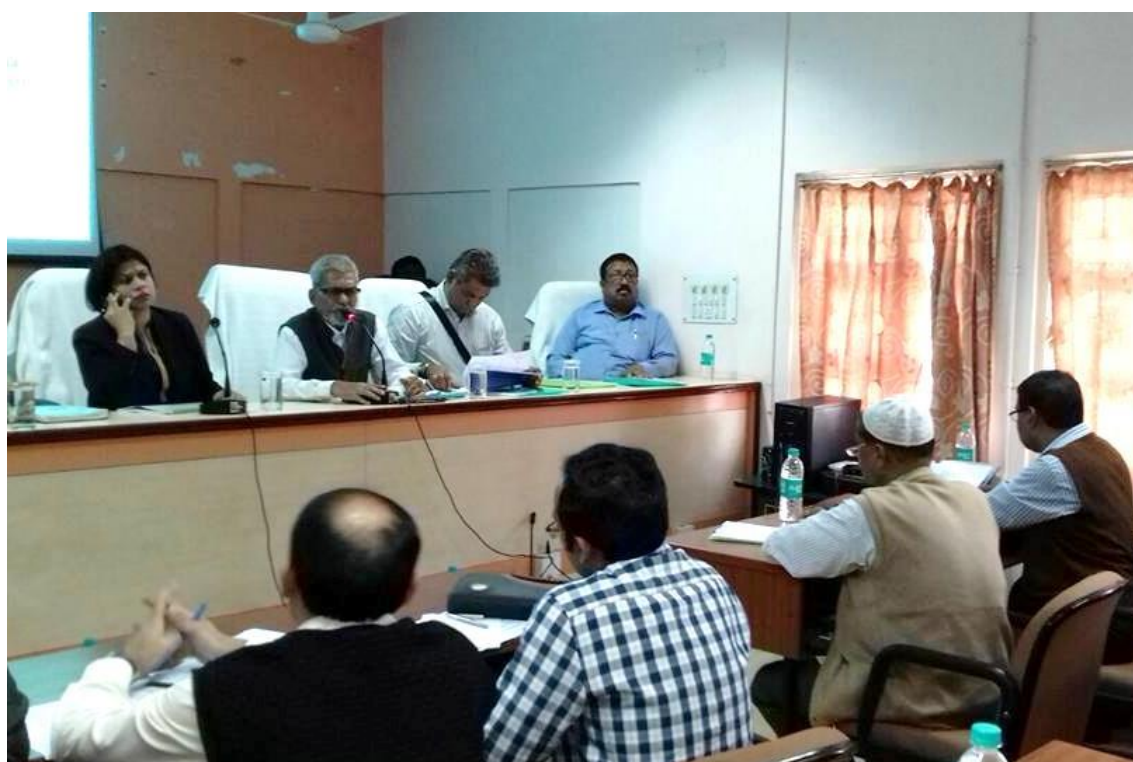
Figure 12: Administrative Meeting at Purba Medinipur on 13.12.2017