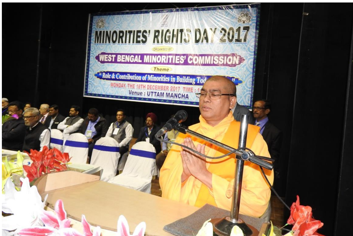
Figure 24: Holy Scriptures is being read by Buddhist Monk