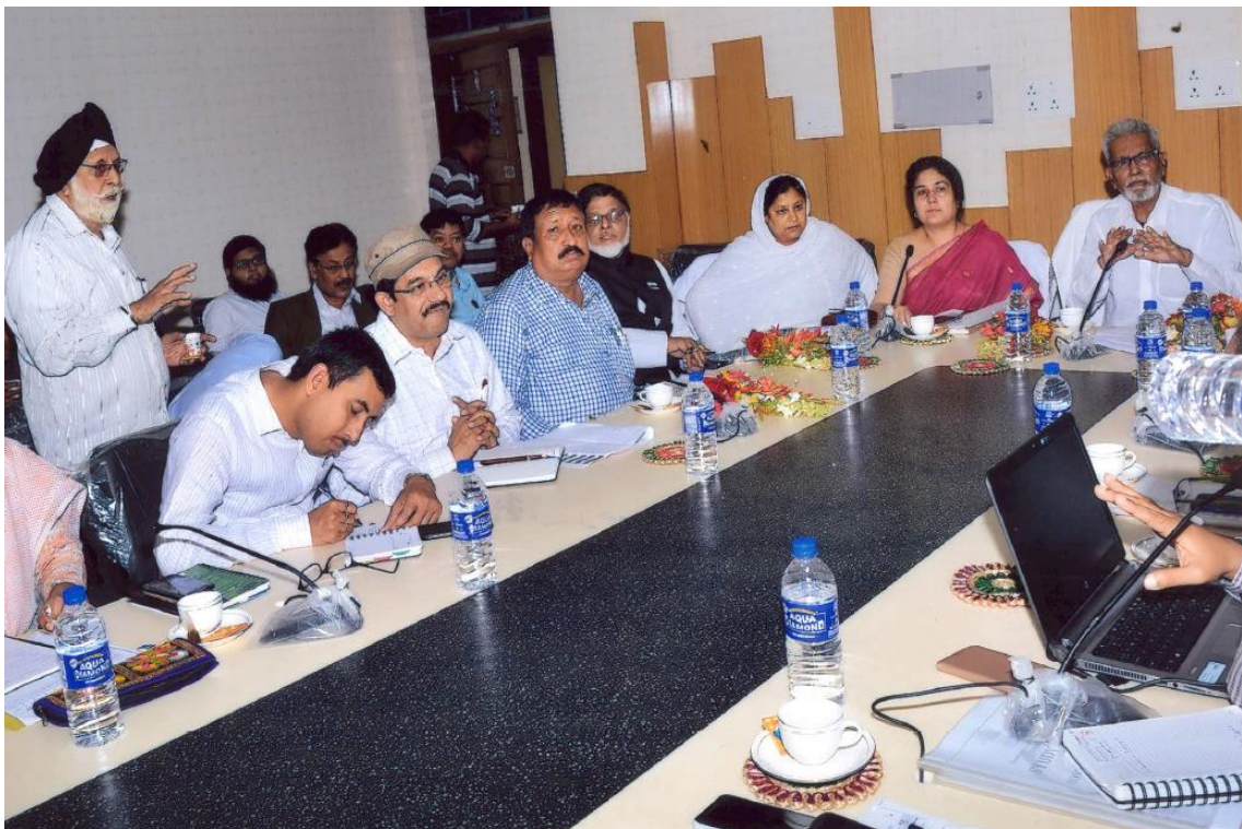
Figure 16: Administrative Meeting at North 24 Parganas on 15.02.2018