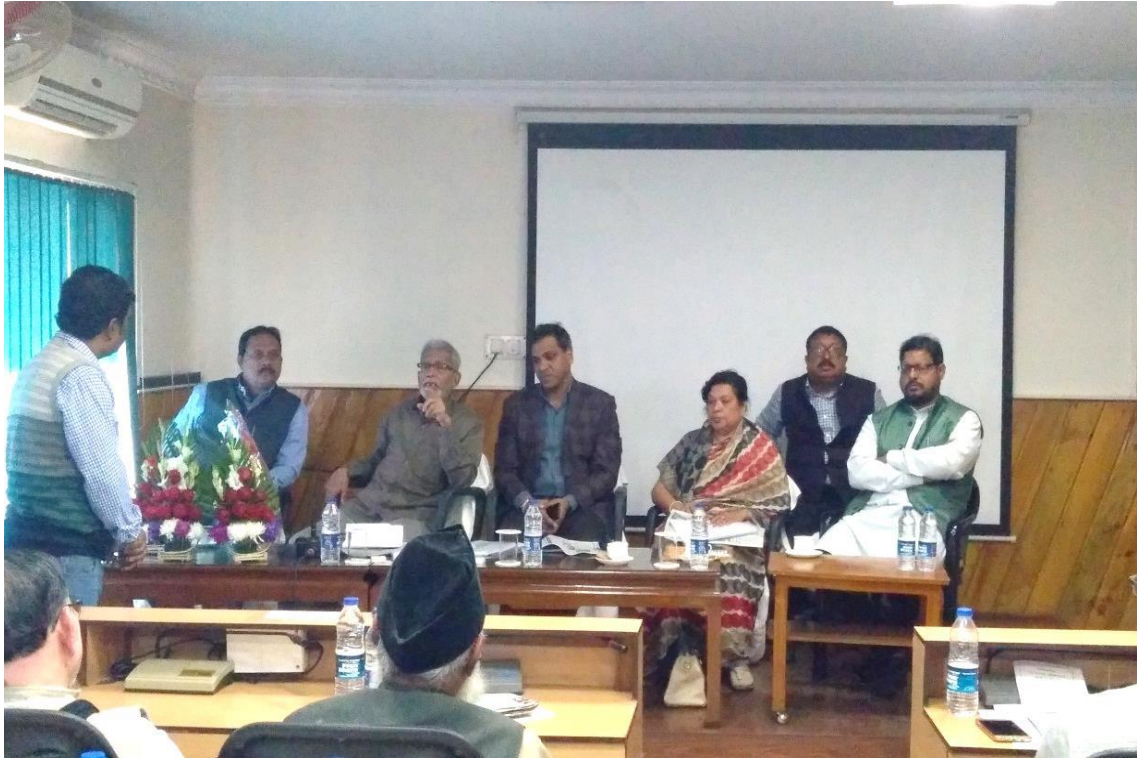
Figure 15: Administrative Meeting at Hooghly on 30.01.2018