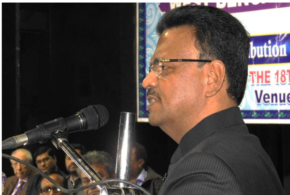
Figure 30: Hon'ble Chief Guest, Janab Firhad Hakim is delivering speech